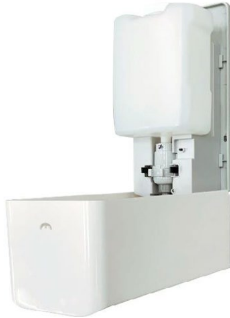
INNER DISPLAY VIEW WITH CARTRIDGE