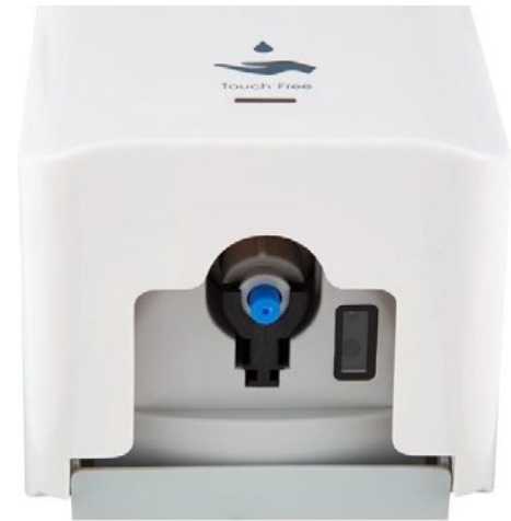
DIFFERENT TYPES WITH UNIQUE OUTLETS