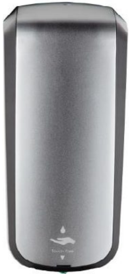
Model: VT-8604D Automatic Hand Sanitizer Dispenser

Material: ABS + Aluminum alloy Dispensing Volume: (0.4ml) Capacity: Approx. 1000ml Operation via 4 x C Alkaline batteries Product Size: W130 x H280 x L120mm Sensor Range: 0-4 inches Color: Black & Grey Inner Box Size: W140 x H128 x L307mm Outer box size: W317 x H395 x L570mm N.W: 2.5 lbs/unit G.W: 2.2 lbs/unit Packing: 12pcs/carton 20ft: 4380pcs 40ft: 11330pcs