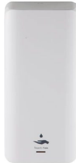
Model: VT-8605D Automatic Hand Sanitizer Dispenser

Material: ABS + Aluminum alloy Dispensing Volume: (0.4ml) Capacity: Approx. 1000ml Operation via 4 x C Alkaline batteries Product Size: W130 x H280 x L120mm Sensor Range: 0-4 inches Color: Black & Grey Inner Box Size: W140 x H128 x L307mm Outer box size: W317 x H395 x L570mm N.W: 2.5 lbs/unit G.W: 2.2 lbs/unit Packing: 12pcs/carton 20ft: 4380pcs 40ft: 11330pcs