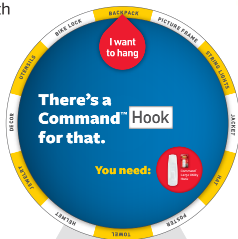
Spiny Wheel Selector

Presented with a curriculum to create a realistic loft bed with two-months to be in stores—our production team got to work. Our Vomela St. Paul group worked with Vomela affiliate, The Bureau, to create uniform kits for Walmart stores. Each kit included a faux loft bed structure to house 3M's Command™ strip products, a selector wheel with pedestal for easy product selection, and a variety of promotional signage pieces including; banners, shelf talkers, and lug ons. The complete promotion shipped partially assembled making it a breeze for in-store setup.