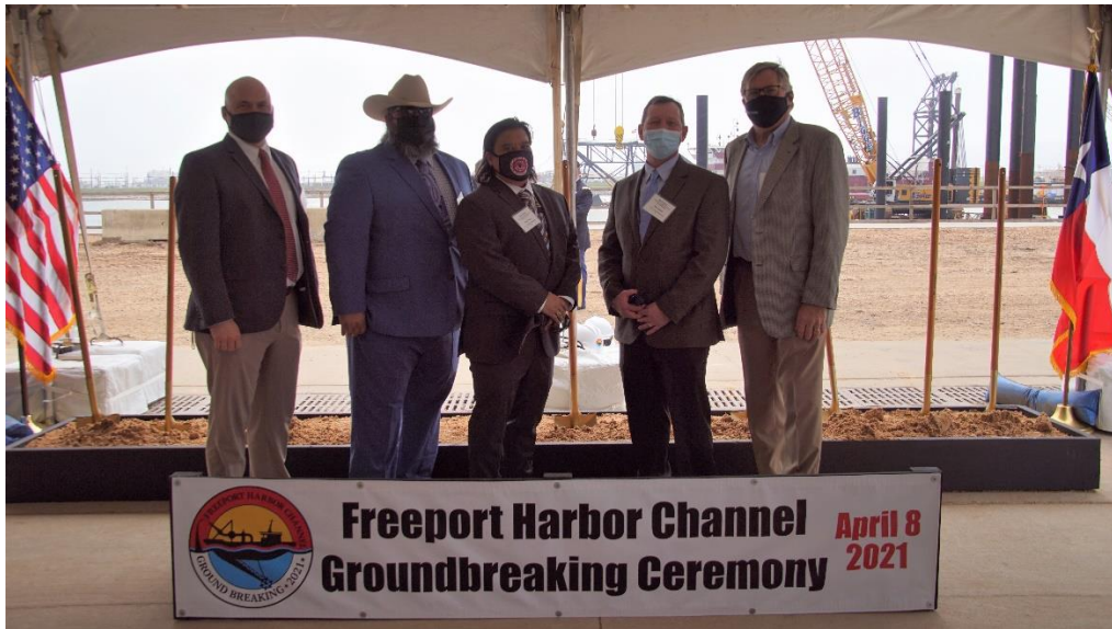
Photo Caption: Dredgers Great Lakes Dredge & Dock Company, LLC participate in the Freeport Harbor Channel Improvement Project Groundbreaking.