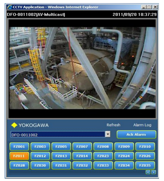
Figure 3 Micropack FDS301 Video Output

An example of this design can be seen in figure 2 and 4. This design using Micropack Visual Flame Detectors has already been implemented successfully on various NUIs in the UKCS. The added benefit of the live video signal from each detector could potentially be beamed to the mother platform via a microwave link, or video over IP system, allowing any potential incident to be monitored from a safe distance and recorded for analysis post fire. An example of the quality of video feed from the Micropack FDS301 is shown in figure 3.