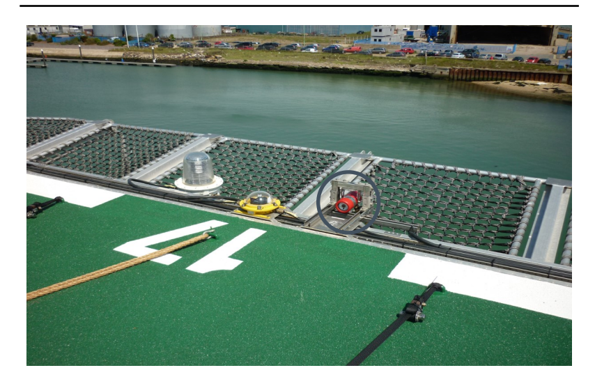
Figure 4 Micropack FDS301 Helideck Installation

Figure 2 Example Helideck Flame Detection Design