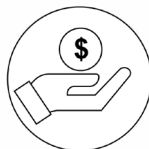
Payday Lending Agent