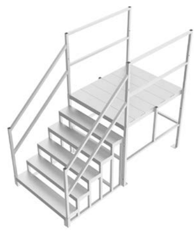
48" x 57" platform