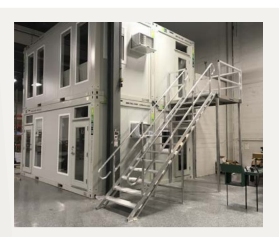
UPS0921 OmniSteps OSHA SellS